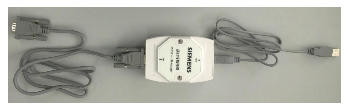
Fig. 1 Connect Cable with Adapter